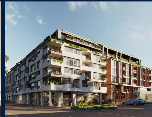
Roden : 2 - Bedroom